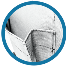
13" Front Gusseted Pocket