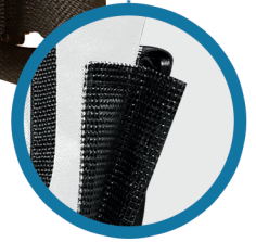
Mesh Side Pocket