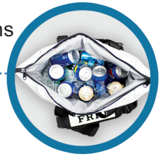
Holds 12 Cans w/ Plenty of Ice