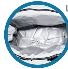
Leak Proof Softside Liner