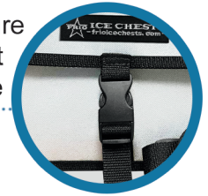
Secure Front Buckle