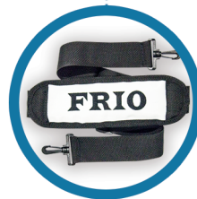
Adjustable Padded Carrying Strap