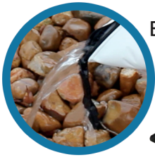
Easy Funnel System