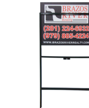
METAL SLIP-IN SIGN FRAME

WARNING: Cancer and Reproductive Harm- www.P65Warnings.ca.gov