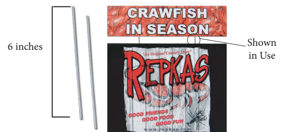
MINI WIRE STAKES

WARNING: Cancer and Reproductive Harm- www.P65Warnings.ca.gov