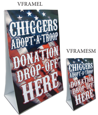
ONE PIECE A-FRAME SIGN

Full Color Edge to Edge Vinyl Applied to Sign