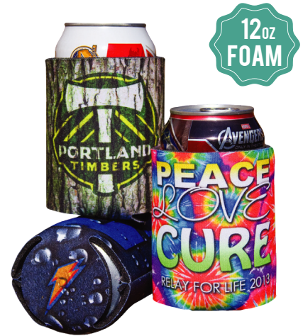
FOAM CAN BEVERAGE HUGGER