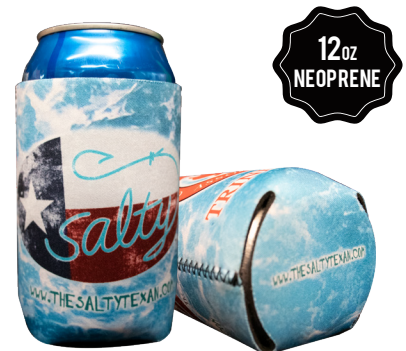
NEOPRENE BEVERAGE HUGGER

⚠️ WARNING: Cancer and Reproductive Harm- www.P65Warnings.ca.gov