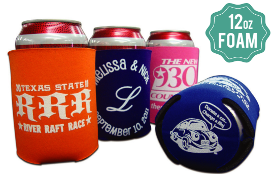
FOAM SCREEN PRINTED BEVERAGE HUGGER

⚠️ WARNING: Cancer and Reproductive Harm- www.P65Warnings.ca.gov